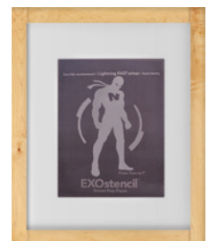
EXOSTENCIL® Screen Prep Paper